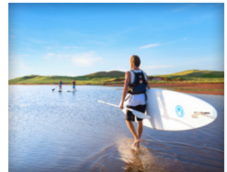
©TPEI017_SL_New London Bay