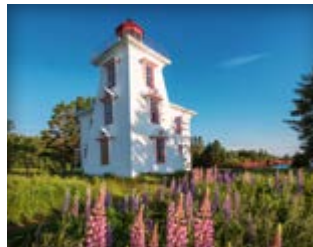
©TPEI21_PB_Rocky Point Lighthouse