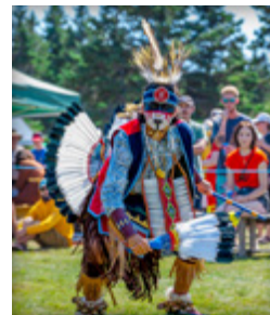
©TPEI022_PAT_Abegweit Pow Wow