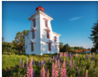
©TPEI21_PB_Rocky Point Lighthouse