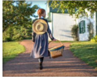
©TPEI19_SH_Anne of Green Gables